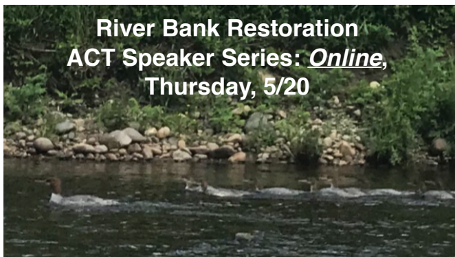
Common Mergansers on the Ammonoosuc River near where the bank restoration and tree planting project are to take place.

The Lisbon Conservation Commission stewards and protects the town's natural resources through planning, promoting and educating to assist the town boards and the public in conservation matters. We encourage informed decision making to keep Lisbon a livable place today and for decades to come.